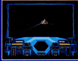
TARGET IN SIGHT .... BLAST AWAY .....