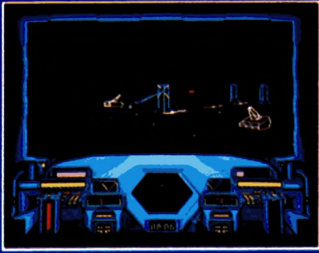
POWER LINE AHEAD.....