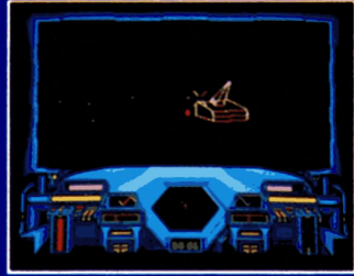
..... CLOSE IN FOR THE KILL .....