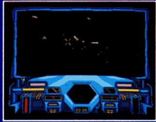
..... TARGET DESTROYED .....