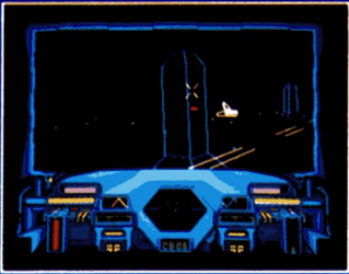
..... READY TO RECHARGE .....