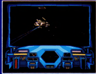
..... KABOOM! .....